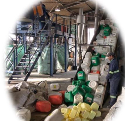
3. Triple rinsed empty HDPE containers on a conveyor on their way cleaning and shredding