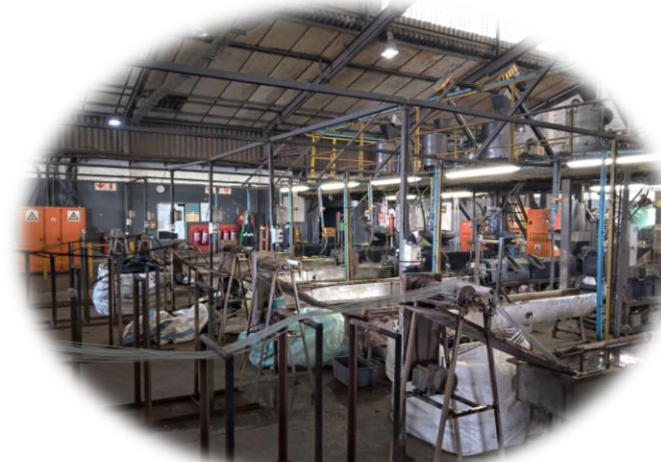
Broad view of a plastic recycling plant