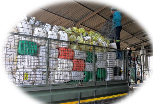
2. Triple rinsed empty HDPE containers delivered to a recycler