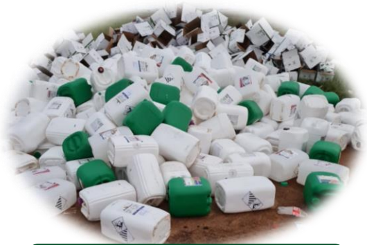
1. Empty HDPE containers on farms