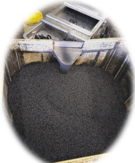
5. Pelletising extruded HDPE plastic