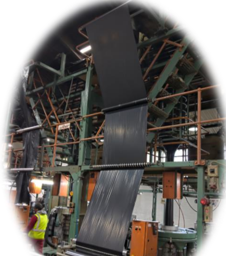
6. Manufacturing plastic refuse bags from recycled HDPE