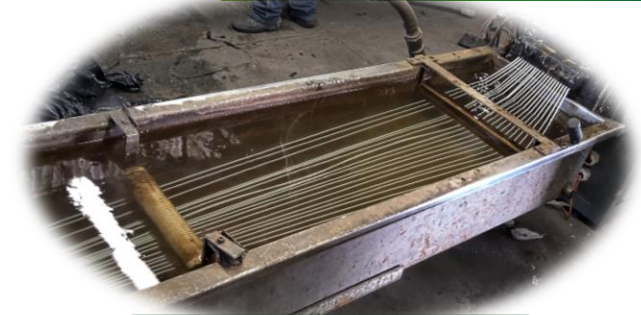
4. Molten HDPE plastic being extruded